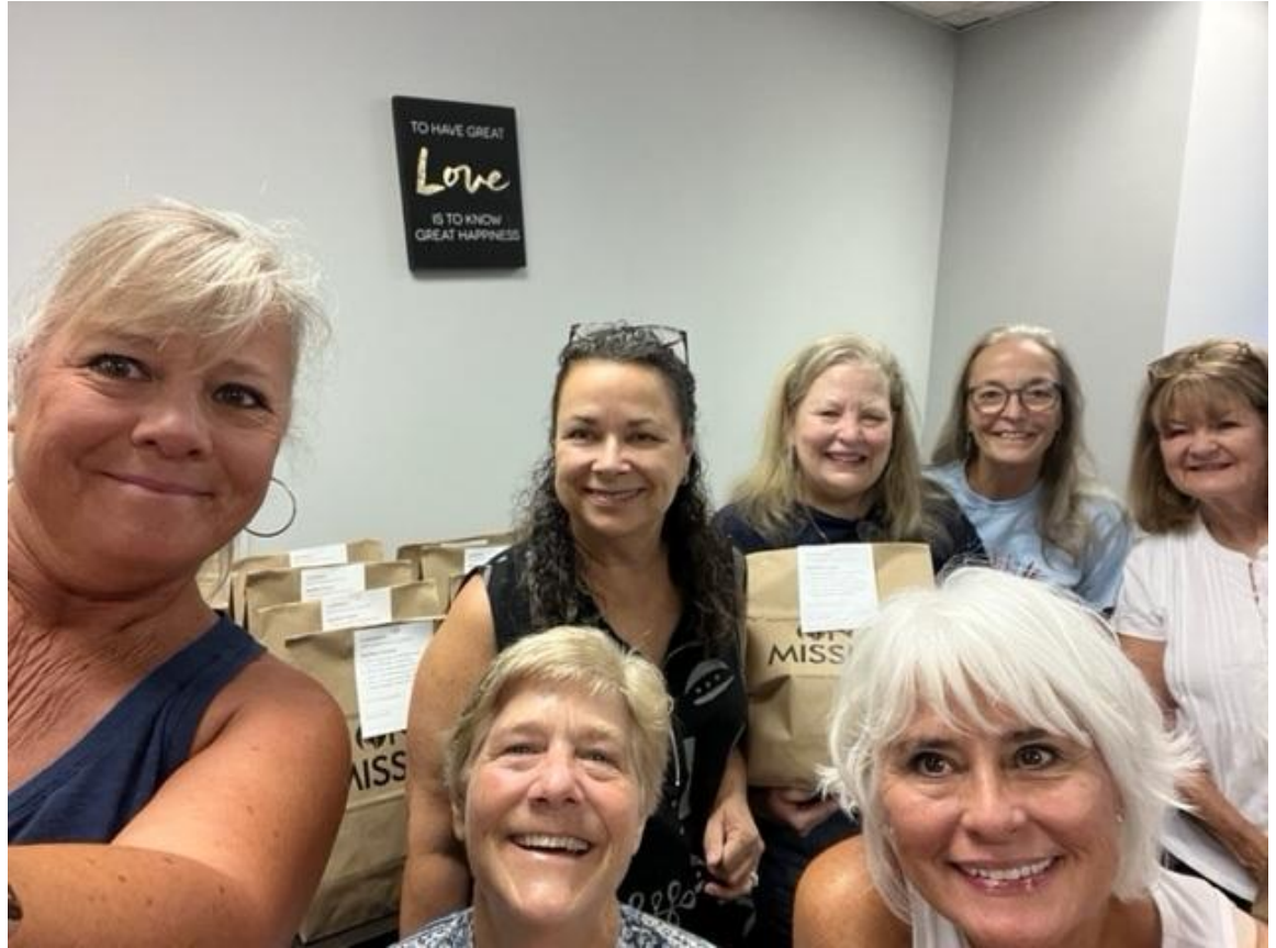
New Horizons enjoyed their time together as they helped prepare for Foodstock.