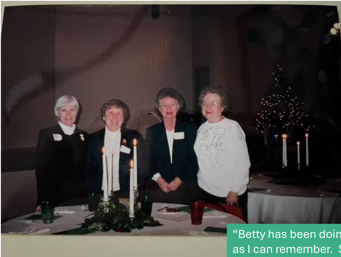
1997 Green + White Banquet