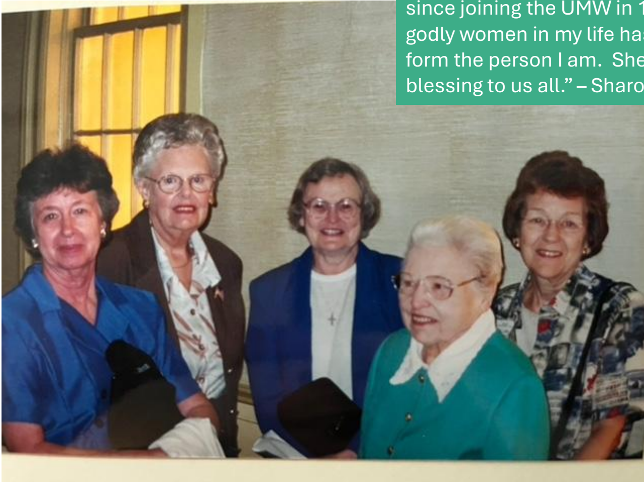
1998 Green + White Banquet